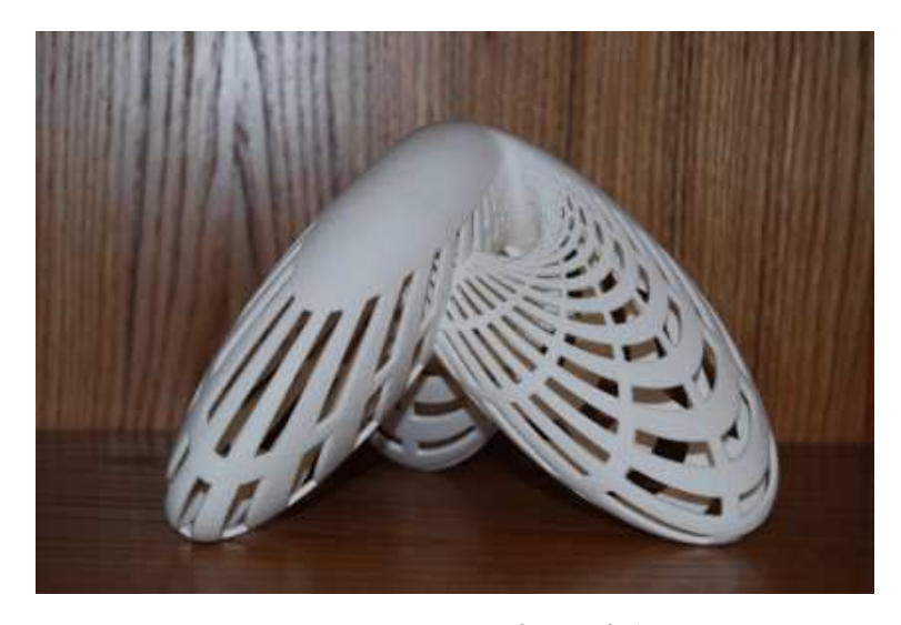
FIGURE 13. Boy surface of degree six