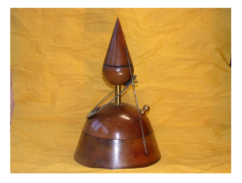
FIGURE 9. Dandelin model