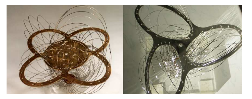
FIGURE 1. Two wire models realized by the author

lead to a physical realization that, in addition, especially when it is the unique solution of a natural problem, enjoys plastic qualities that artist souls, like surrealists in the thirties, can take over. One can not refrain from combining visual and tactile pleasure, without depriving oneself of the feeling of substance and materials. Virtual imaging is excellent but it is not all. It is sometimes difficult to develop a correct mental image without having the object to hand.