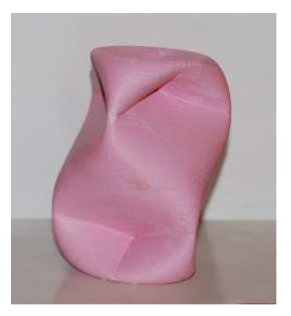
FIGURE 12. Etruscean Venus