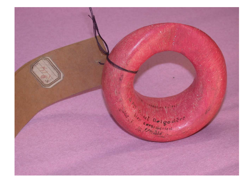
FIGURE 3. The one-sided cyclid

segment. Up to ambient isotopy, the mapping remains unchanged by a small perturbation.