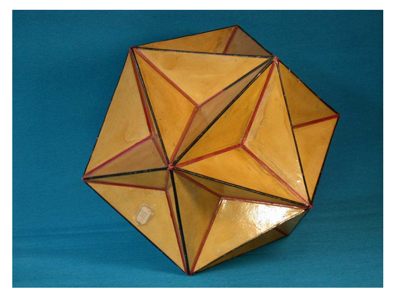
FIGURE 6. The great dodecahedron