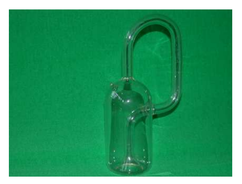
FIGURE 2. Klein bottle

of Klein bottle, although according to some historians, its origin would rest on a confusion between the german words "Flasche" and "Fläche".