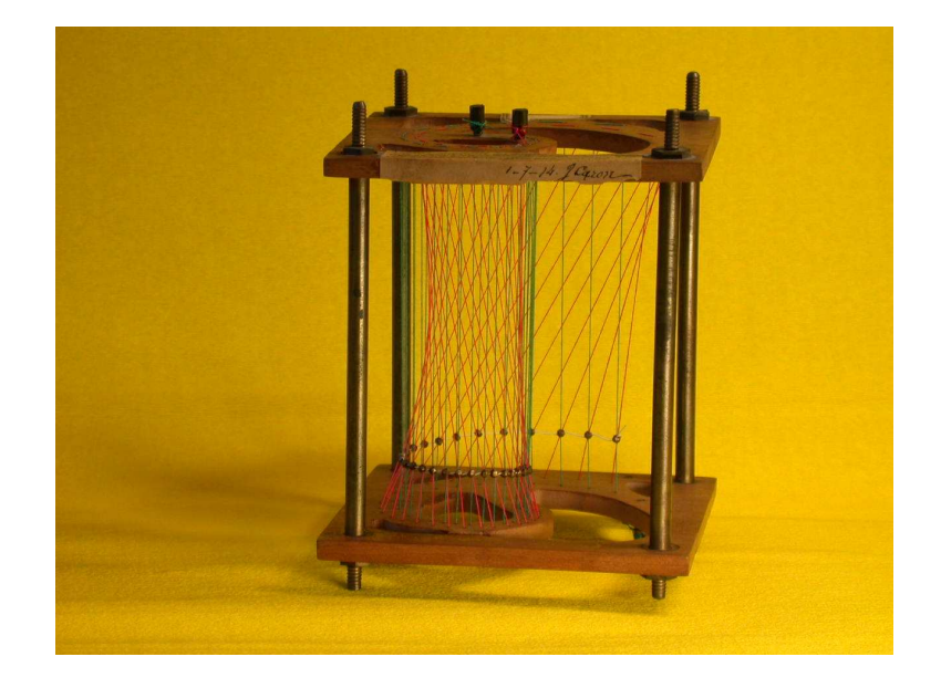
FIGURE 10. Intersection of two surfaces

On a wooden cone divided into two parts in order to make two inscribed wooden spheres visible, one notices, on one hand, a brace rod figuring a generating line of the cone, and, on the other hand, a metallic ellipse whose plane is tangent to both wooden spheres. The points of tangency on the spheres materialize the focus of the ellipse (first part of Dandelin theorem), whereas the touching circles of the spheres with the cone define planes meeting that of the ellipse along its directrices (second part of Dandelin theorem).