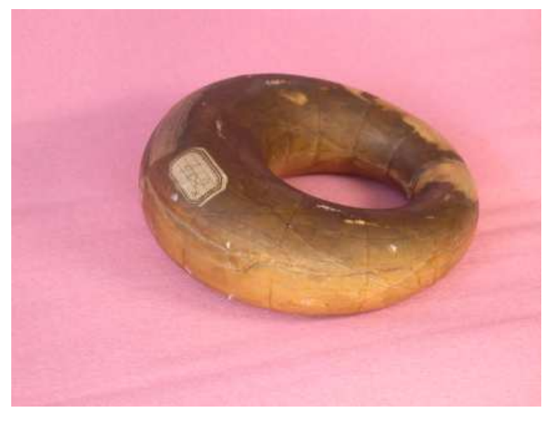
FIGURE 5. Ring Dupin cyclid