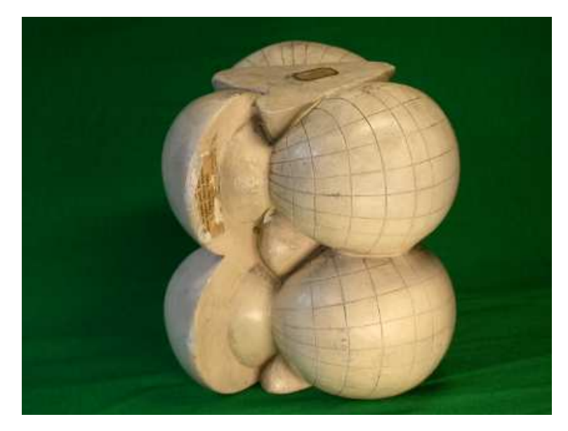
FIGURE 11. Sievert surface

revolution cylinder, that is by connecting (with a red sewing thread) the generic point of the upper spiral, with the point of the lower spiral the polar angle of which being shifted by a constant. The intersection curve of the two surfaces occurs as a sequence of small pearls.