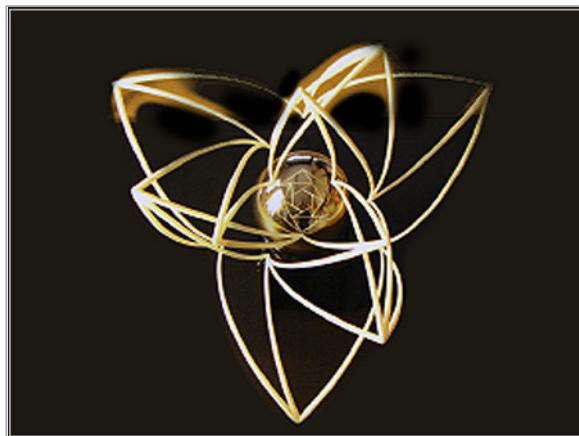
3D anamorphosis. 40cmx40cm*20cm. Wood and plastic.