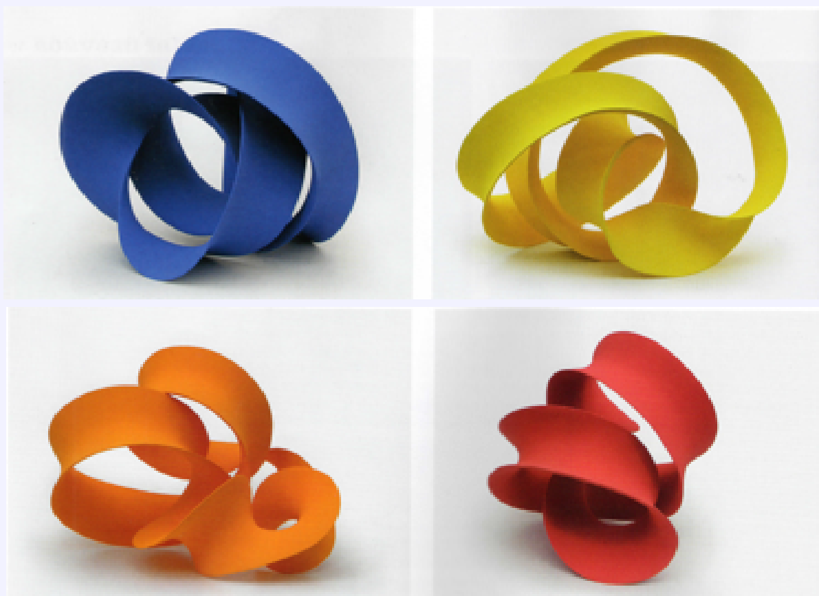
up: Blue Triple Twisted Yellow Loop (2014) (2014)