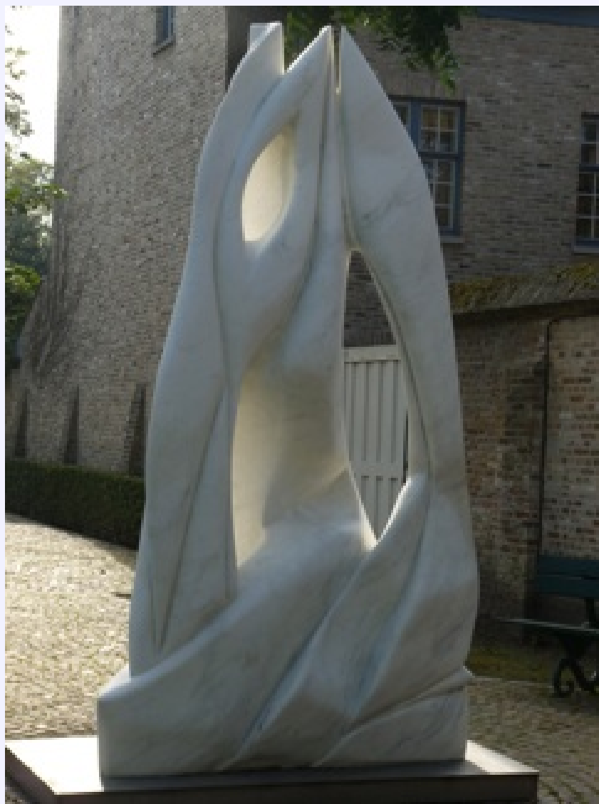
Before the Groeningemuseum in Bruges